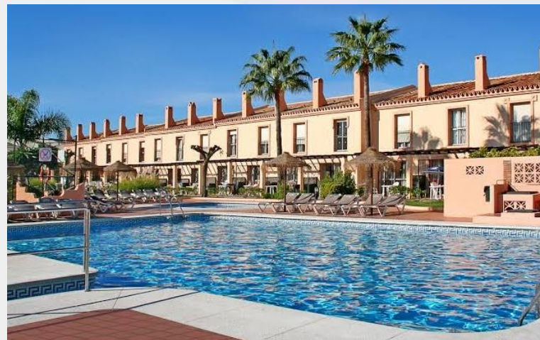
Ramada Hotel & Suites by Wyndham Costa del Sol